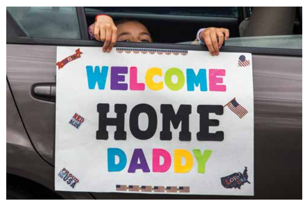
A family member displays her sign for the Headquarters and Headquarters Company, 44th Infantry Brigade Combat Team welcome home ceremony at the Joint Military and Family Assistance Center, Bordentown, N.J., April 4, 2020.

"Ease back into it, you can't make up for the lost year and all that lost fun in