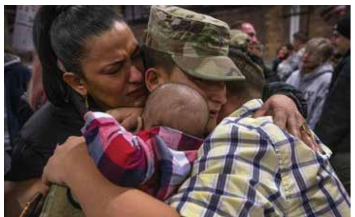
Top photo: U.S. Army Soldiers with the 1st Squadron, 102nd Cavalry, New Jersey Army National Guard, salute during the national anthem at the welcome home ceremony at the National Guard Armory in Westfield, N.J., Dec. 12, 2019. Middle photo: An attendee displays her poster during the 102nd's welcome home ceremony. Bottom photo: U.S. Army Soldiers are reunited with their families and friends after the ceremony.

challenge because of some of the missions the unit drew and the places they went. One company was assigned to work with Special Operations troops in Africa. Several of those Soldiers earned the Combat Infantry Badge.