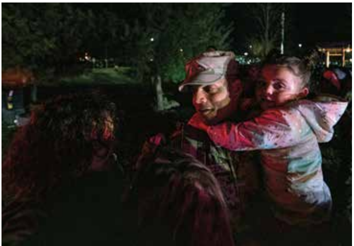
U.S. Army Soldiers with Charlie Company, 1-114th Infantry Regiment, are welcomed home by family members and friends.

More than one hundred and thirty Soldiers arrived in Blackwood, greeted by local fire departments and