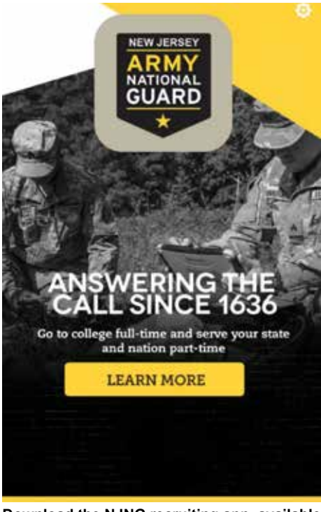
Download the NJNG recruiting app, available for Apple and Android devices.

Who better than us, the Soldiers and Airmen of the New Jersey National Guard, to answer that call?