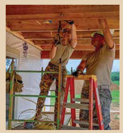
Airmen with the 108th and 177th Civil Engineering Squadrons install electrical circuits on a cabin porch at Camp Kamassa, Aug. 1, 2019.

"This was a great opportunity to do something really positive," said Lt.