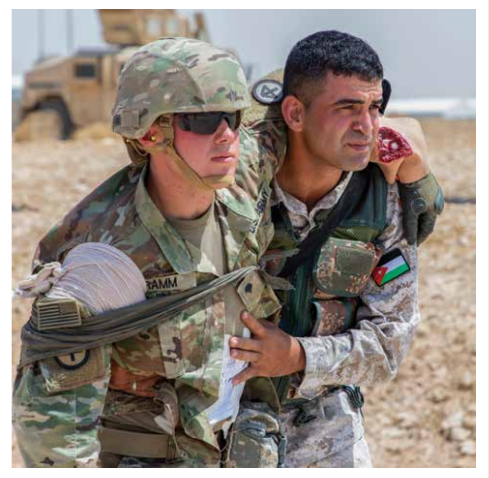
Above: A Jordanian Soldier with the 7th Mechanized Battalion, 48th Mechanized Brigade, supports a Soldier with the 1st Squadron, 102nd Cavalry Regiment, New Jersey Army National Guard, with simulated arm and abdominal injuries during medical evacuation training, part of the Jordan Operational Engagement Program at Joint Training Center-Jordan Aug. 27, 2019. Below: Soldiers with the 7th Mechanized Battalion protect a simulated injured 102nd Cavalry Regiment Soldier as a UH-60 Black Hawk lands.