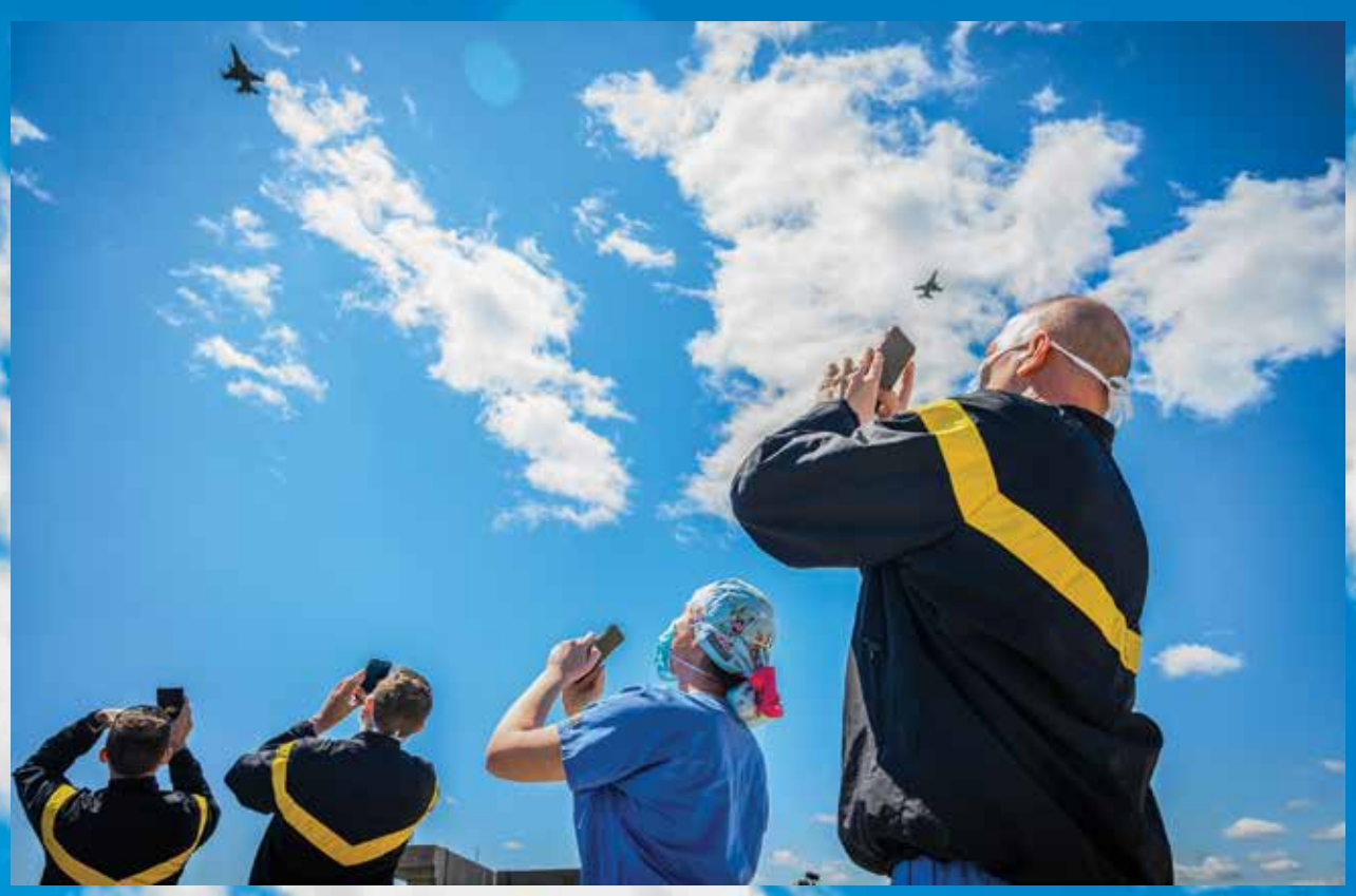
Above: U. S. Army Soldiers with the New Jersey Army National Guard take pictures of a flyover at University Hospital in Newark, N.J., during the Air Force Salutes flyover campaign by the New Jersey Air National Guard's 108th Wing and 177th Fighter Wing to honor healthcare workers, first responders, and other essential personnel working on the front lines to combat COVID-19, May 12, 2020. Below: New Jersey National Guard Soldiers and Airmen take pictures of two 177th F-16 Fighting Falcons as they fly over the New Jersey Veterans Home at Paramus in Paramus N.J., May 12, 2020.