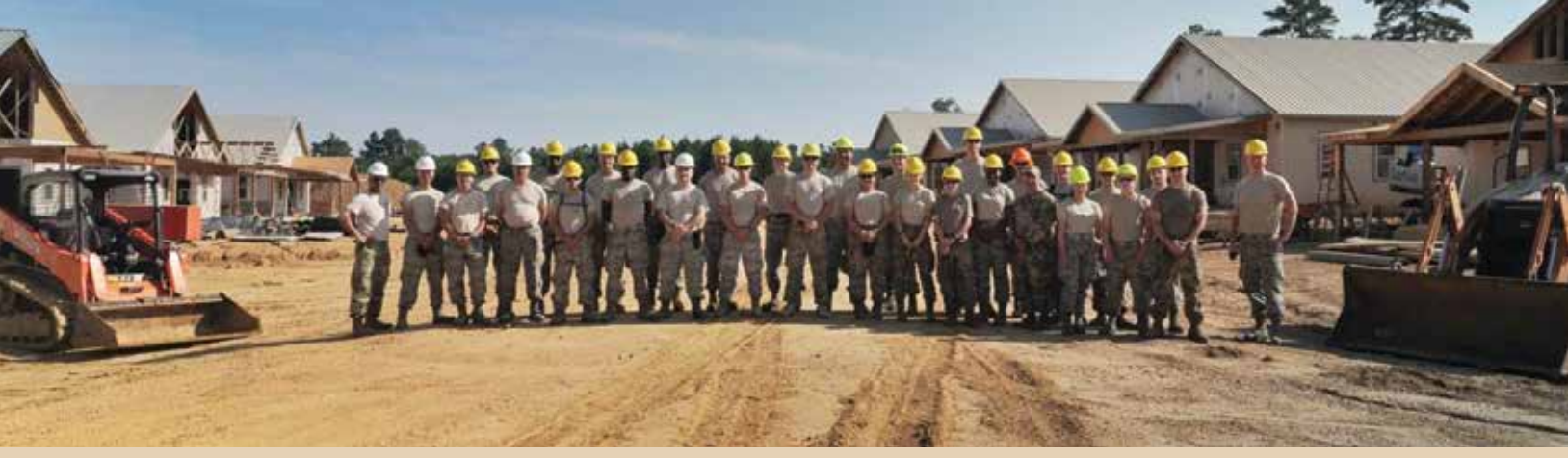
Airmen with the 108th and 177th Civil Engineering Squadrons pose for a group photo at Camp Kamassa, Crystal Springs, Miss., Aug. 1, 2019. The Squadrons partnered with the Mississippi's Toughest Kids Foundation to help build Camp Kamassa, a year-round camping facility for children and adults with serious illnesses, disabilities, or other challenges.