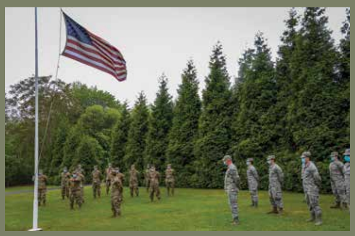
New Jersey Air National Guard Airmen with the 108th Wing and the 177th Fighter Wing, conduct a retreat ceremony for the residents of the New Jersey Veterans Memorial Home at Vineland, N.J., May 22, 2020.

Airmen are getting food orders for residents, talking with them, and keeping them in touch with their families. We're giving them that interaction that is a basic human need."