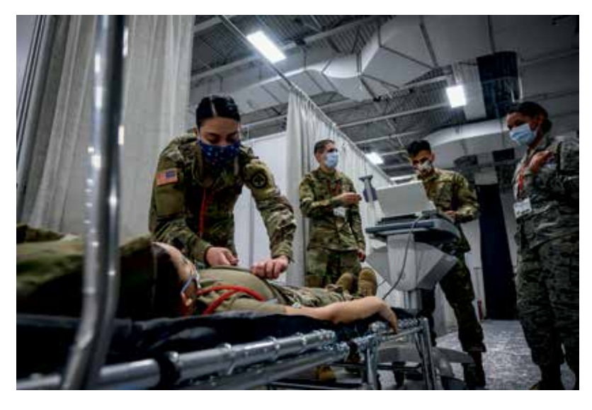
Top photo: New Jersey Army National Guard (NJARNG) Soldiers with Joint Task-Force 57 (JTF 57) conduct inventory at the Meadowlands Exposition Center, Secaucus, N.J., March 28, 2020. Middle photo: JTF 57 Soldiers set-up the Field Medical Station at the Meadowlands Exposition Center, March 31, 2020. Bottom photo: NJARNG combat medic specialists with JTF 57, test an electrocardiogram at the Meadowlands Exposition Center, April 6, 2020.